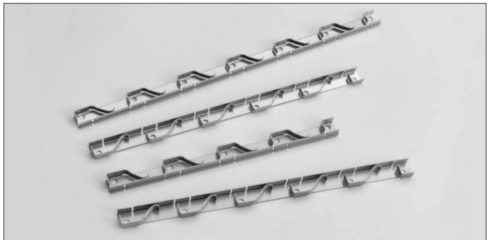
Series 125/126/165/166 retainers