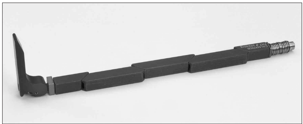
Series LE260 "Card-Lok" Retainer (extracting/lever-lok)